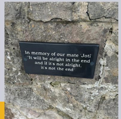
Joti's commemorative plaque