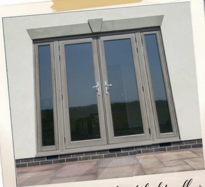
French doors with sidelights allow in plenty of extra light