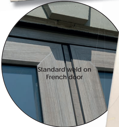
Standard weld on French door