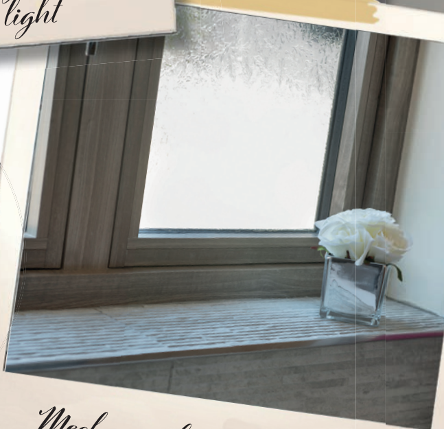
Mechanical joints on windows